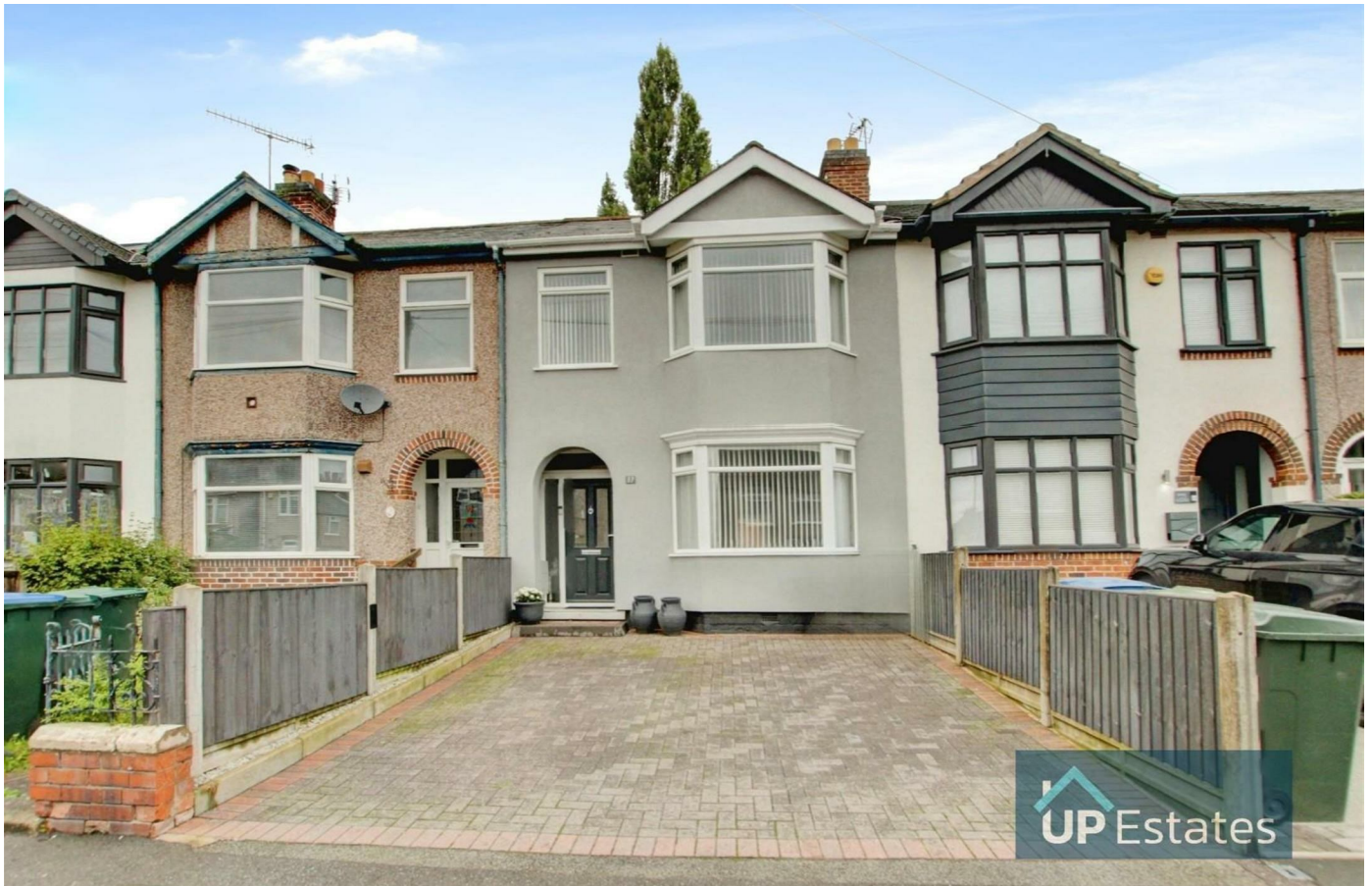
Hermitage Road, Coventry